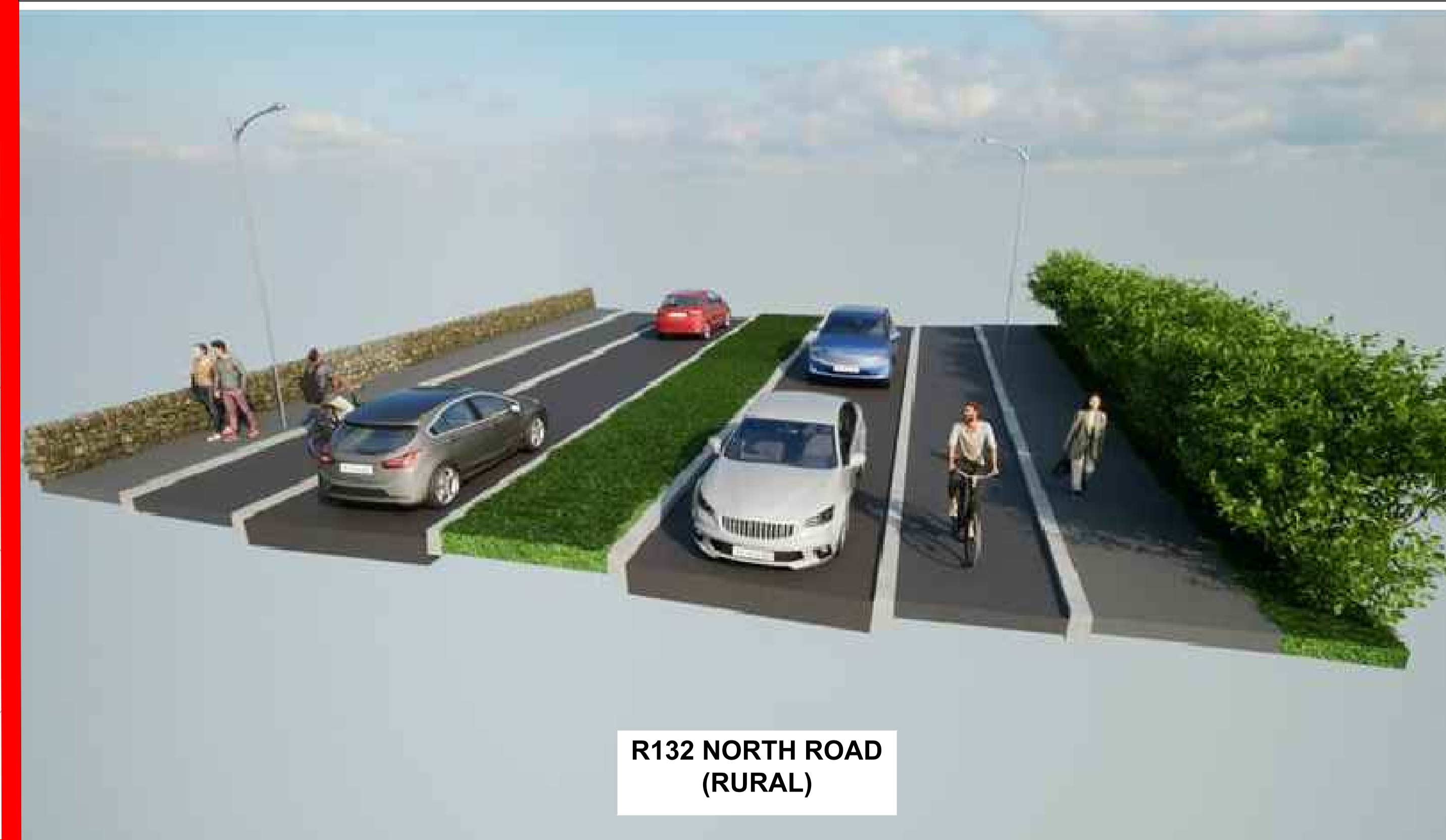
R132 NORTH ROAD (RURAL)