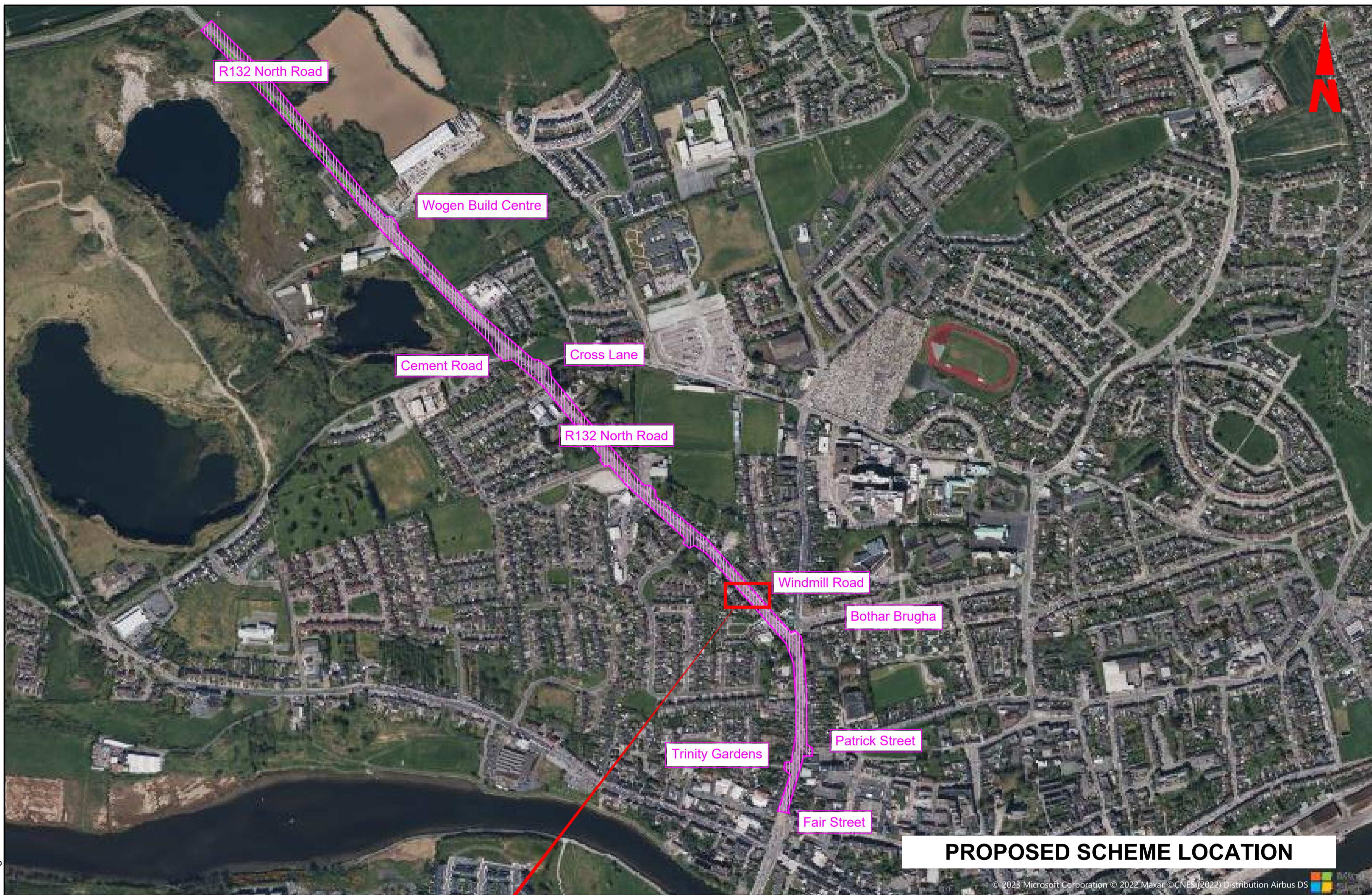
PROPOSED SCHEME LOCATION