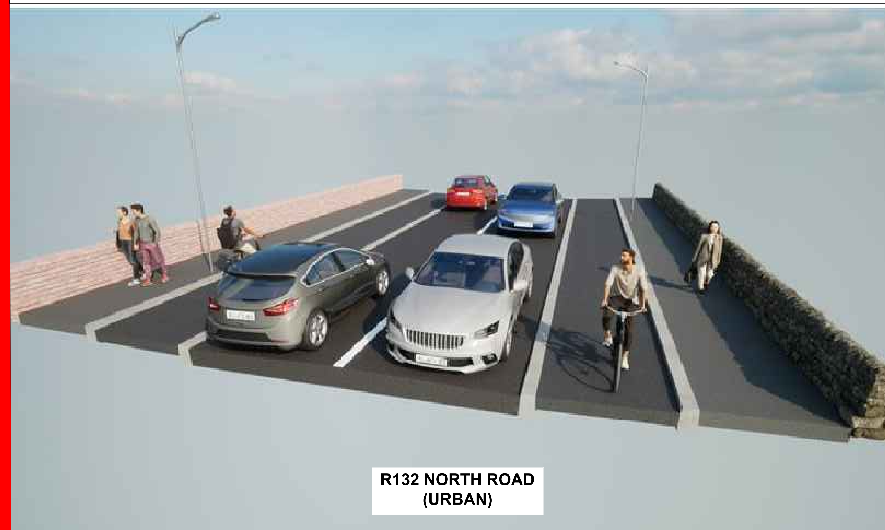
R132 NORTH ROAD (URBAN)

Client: National Transport Authority Key Plan