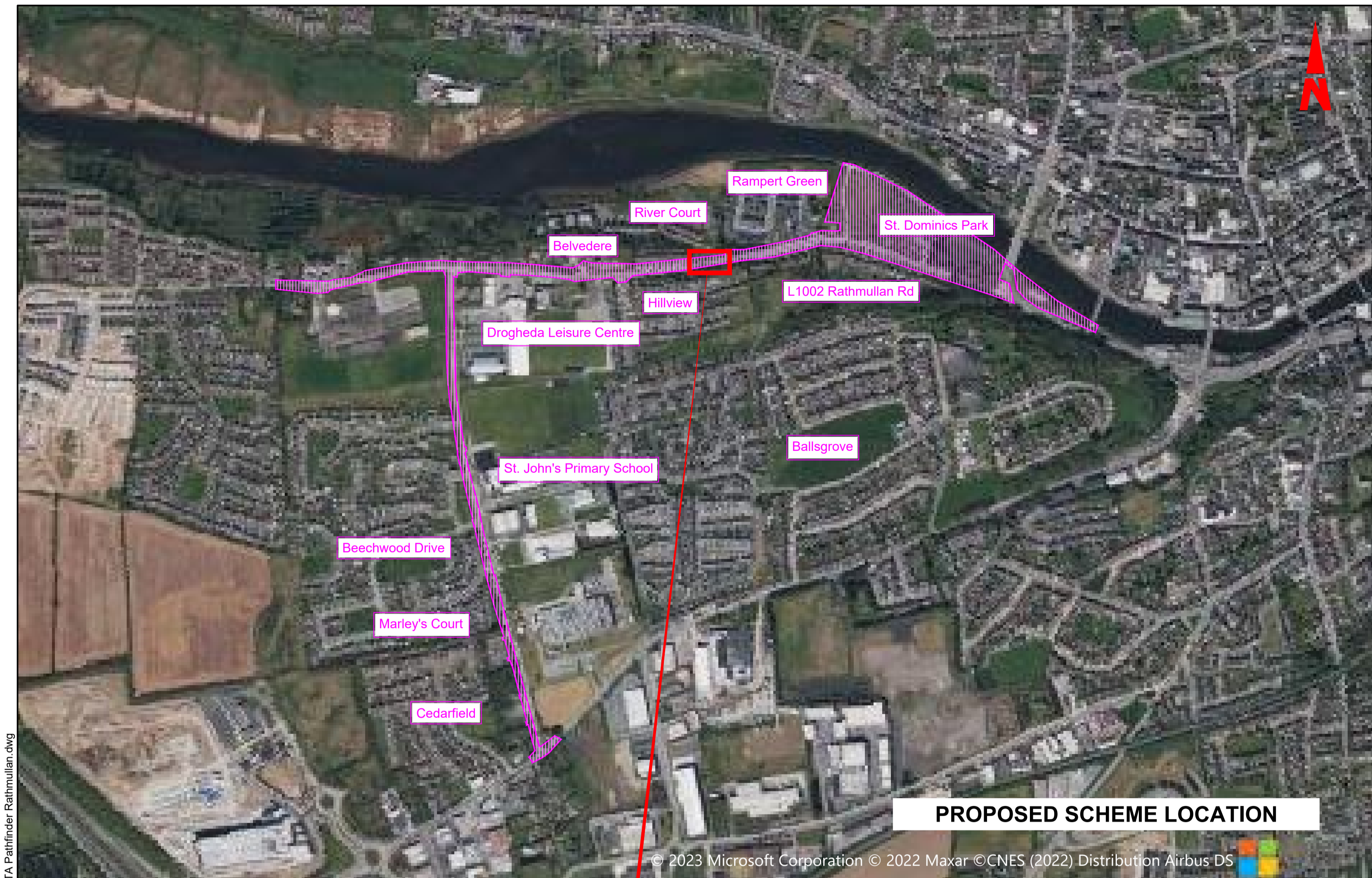
PROPOSED SCHEME LOCATION