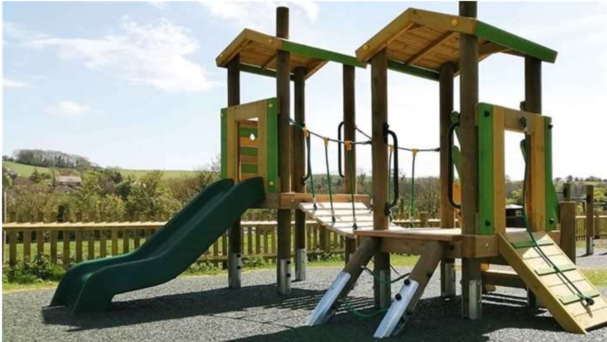
Figure 1: Modular Play System