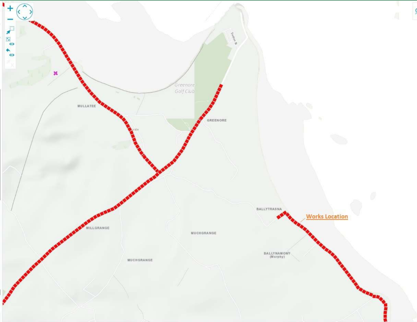
Plate 4 - Ballynamoney (Murphy)/Ballagan Scenic View, Scenic Route & Area of ONB Review