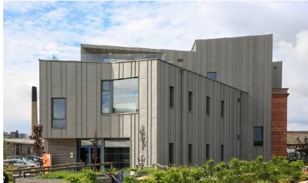
Cladding for New-Build Extension

Random rubble stone walling. Dressings in a lighter limestone.