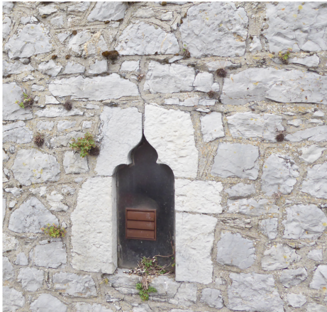
Existing Tower House Walling and Dressings

Random rubble stone walling. Dressings in a lighter limestone.