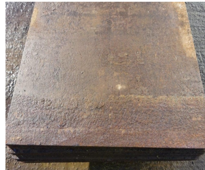
Dressing to new openings in Tower House Walls

Polyester powder-coated aluminium window system. 50mm framing provides maximum clear glazing area and presents a clean simple profile.