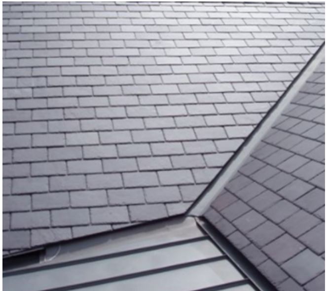
Roof Covering to Judge's Chambers

Vertically oriented, standing-seam zinc with a pre-weathered 'Quartz' finish.