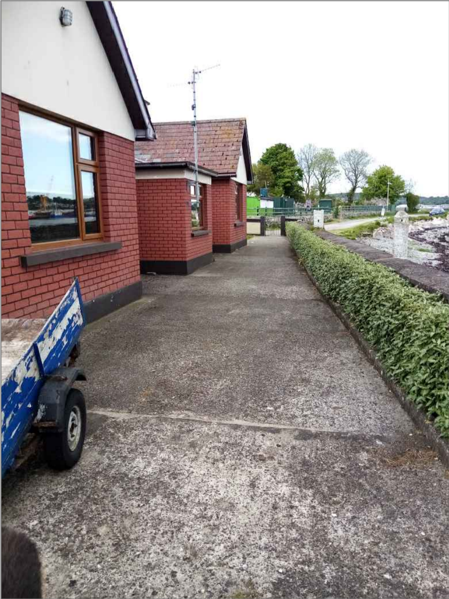
Image P2 View within property