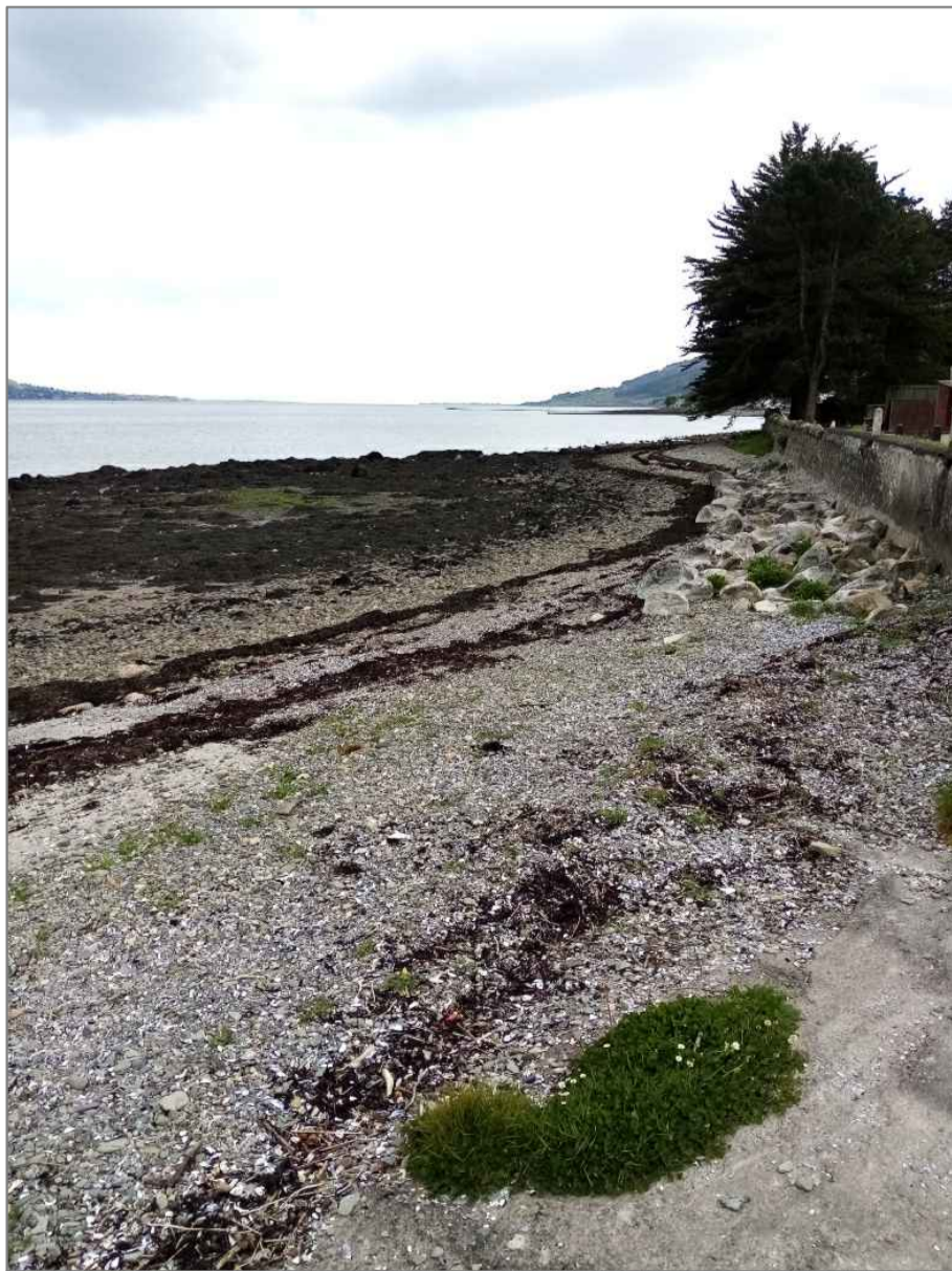
Image P3 View of shoreline