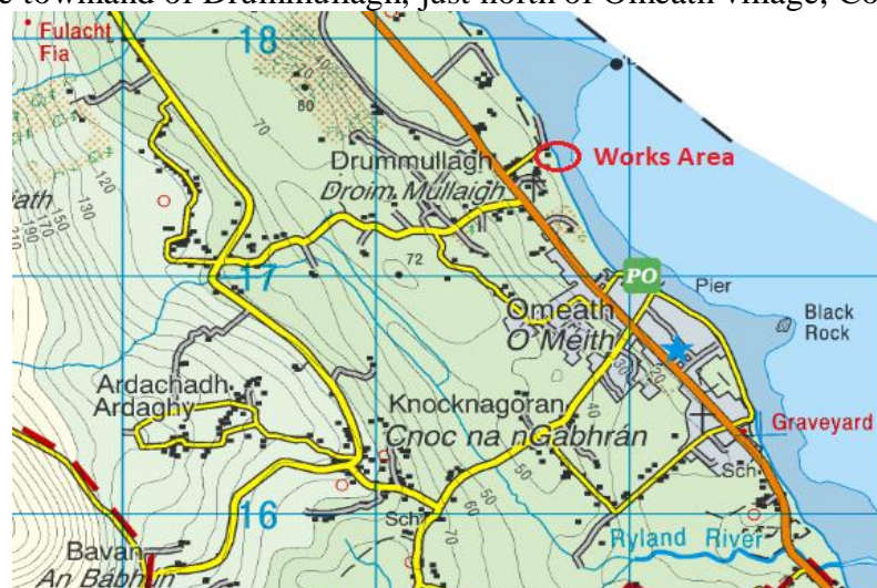
Image 1 Works Location

The proposed works location is along the shoreline of Carlingford Lough on the Cooley Peninsula in the townland of Drummullagh, just north of Omeath village, Co. Louth.