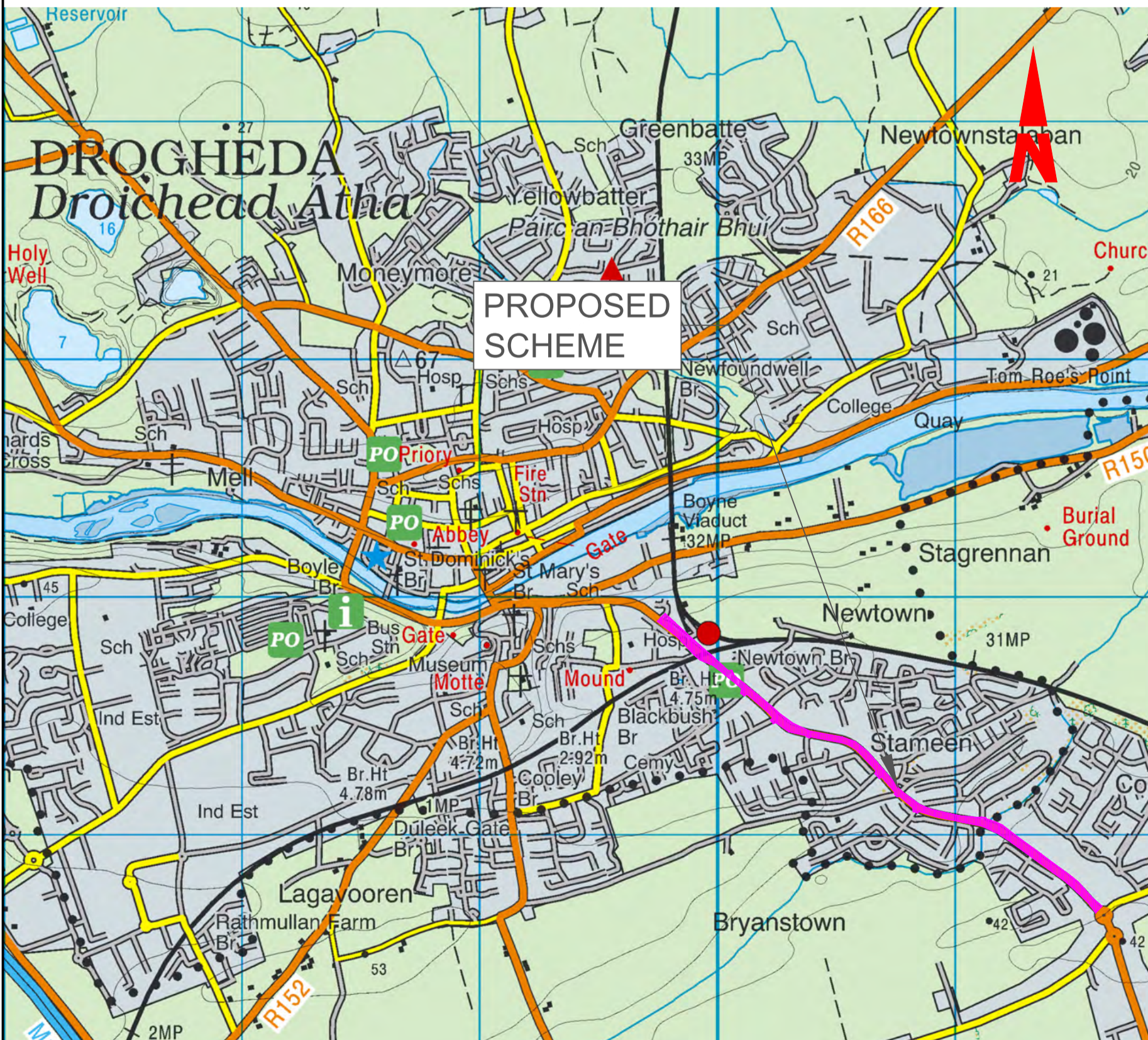
PROPOSED SCHEME LOCATION Scale; 1:20,000 @ A1, 1:40,000 @A3