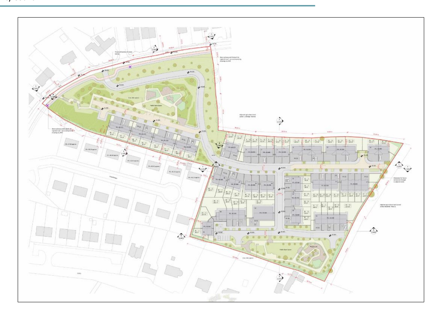
Figure 4.2 Proposed site layout at the Mullavalley site provided by EML Architects