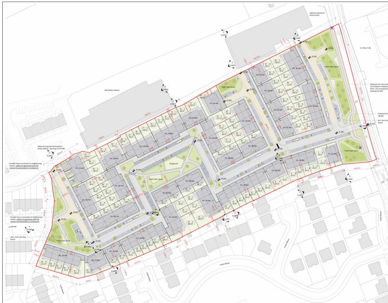
Figure 2 Proposed site layout at the Ballymackenny West site provided by EML Architects